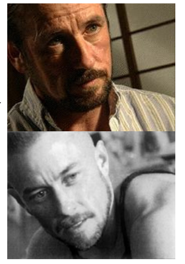
Two Images from "You Don't Know Dick", A documentary about women who have chosen to change their gender to live as men.

Native Americans consider gender to be fluid determined by dreams, vision quests, and messages from Two Spirit or ancestors (Feinberg, 1996).