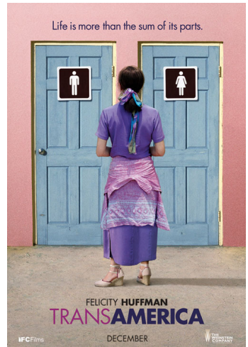
Publicity flyer for "Transamerica" (M2F)

Counselors should be aware that employers are required to provide reasonable access to restroom facilities. With transgender employees, human resources managers often address the corporate bathroom issues with the "Principle of Least Astonishment" suggesting that a person who presents as a woman will be less astonishing using the woman's bathroom. If a concern evolves, the employer must provide alternative solutions (Beth, 2005). The creation of unisex bathrooms not only benefits transgender people but also parents who wish to assist their youngsters and adult partners who wish to help each other. A man, for example, can assist a disabled woman partner more easily in a unisex bathroom.